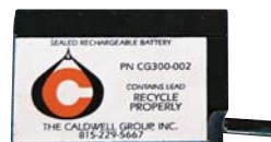
Two Rechargeable Batteries