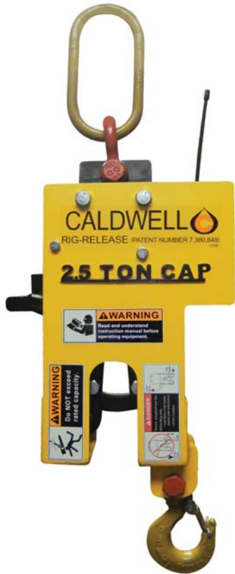
2-1/2 Ton Unit Shown