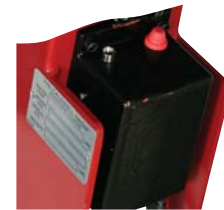
On/Off Button (shown in red)