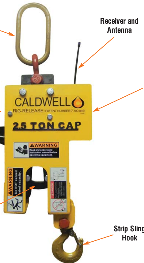
Strip Sling Hook