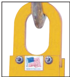
Fixed bail on 5 Ton unit