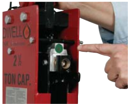
Mechanical Release Button (shown in green)