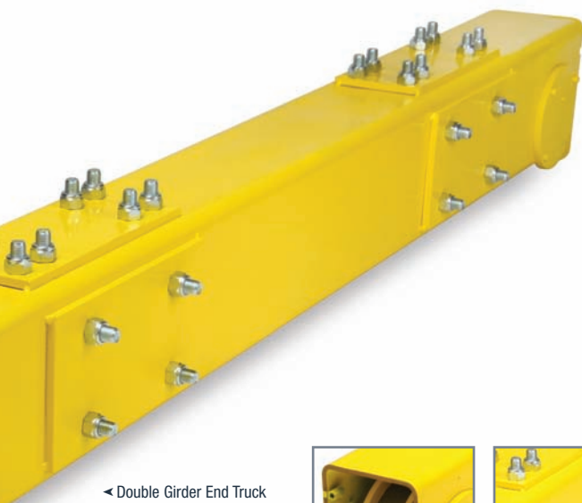
◀ Double Girder End Truck