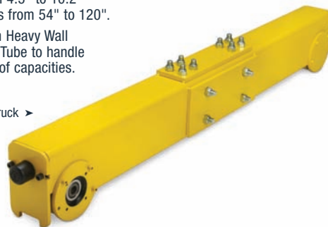
Single Girder End Truck ▶