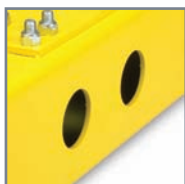
Hand Holes for access to connection plates