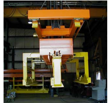
This fully automated sheet lifter is permanently attached to the crane. It also features motorized end supports to reduce the effect of bellying on thin gauge materials.