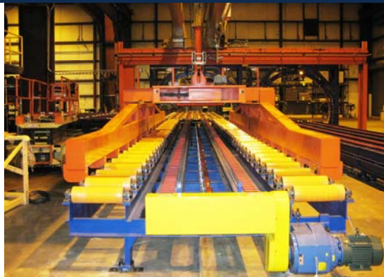
Bushman recently designed this sheet lifter and crane system for a steel and aluminum blanking company. This customer was adding plastic wrapping as a new value-added service. Bushman's heavy duty, motorized sheet lifter picks up 30,000 pound plastic wrapped stacks from a conveyor and puts them on a shipping pallet. This single lifter can safely pick up a wide range of sheet lengths and widths. The lifter has 14 lifting forks on each side, spaced to clear the conveyor rollers, helping to reduce the potential for product damage.