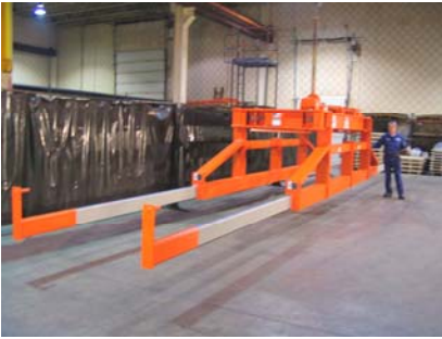
25,000 pound capacity sheet lifter with telescoping carrying arms. Four leg extensions can be manually extended to 40 feet overall length.