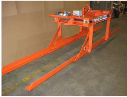
Sheet lifter with pin-on angle extensions.