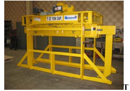
This lifter has two sets of motorized legs to secure the sheet stacks on all four sides.