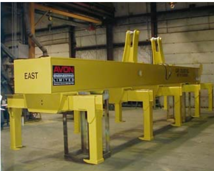
This telescopic plate lifter has rack and pinion design. This 40,000 pound capacity, mill duty lifter has a two-point crane suspension. It can handle plates up to 146 inches wide and 40 feet long.