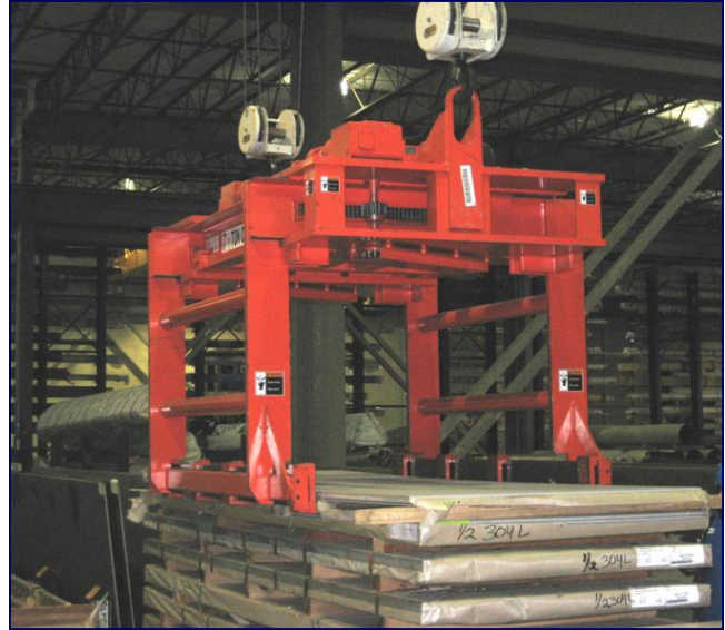
This 15,000 pound capacity sheet lifter is rated for heavy service. It has adjustable lifting feet for lifting palletized or non-palletized sheet stacks.