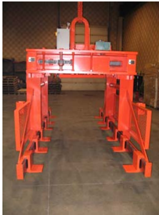
This sheet lifter with adjustable position lifting feet operates somewhat like a fork truck. The feet can be adjusted to fit various loaded pallets.